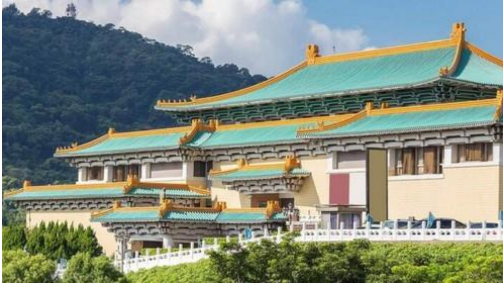
National Palace Museum